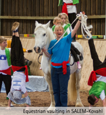
Equestrian vaulting in SALEM-Kovahl