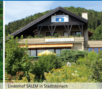
Lindenhof SALEM in Stadtsteinach