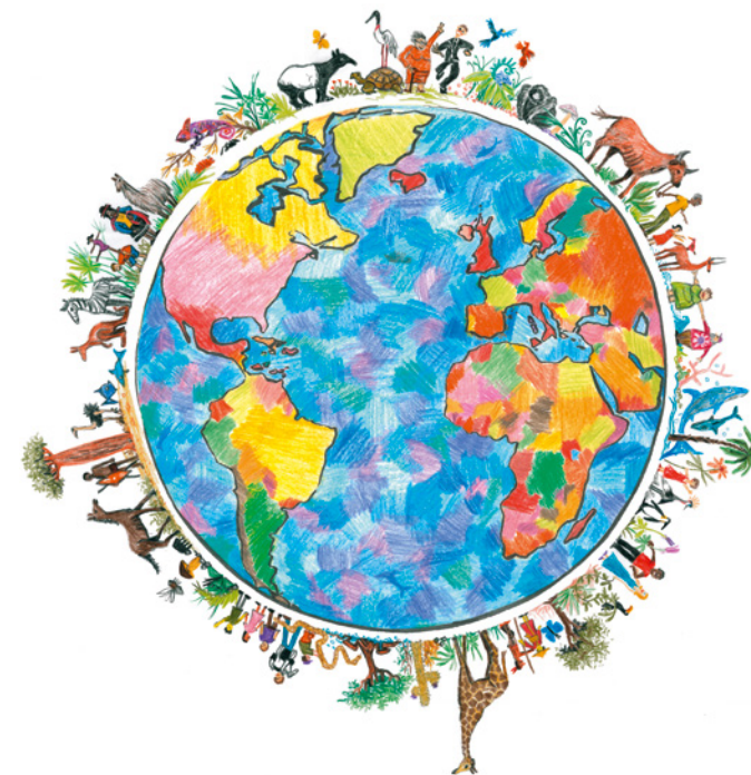
Artwork: queens-design.de Illustration: Stefan Hage