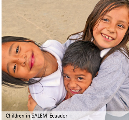
Children in SALEM-Ecuador