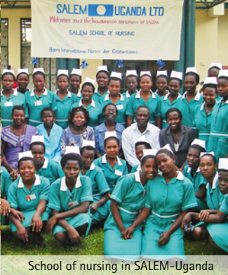
School of nursing in SALEM-Uganda