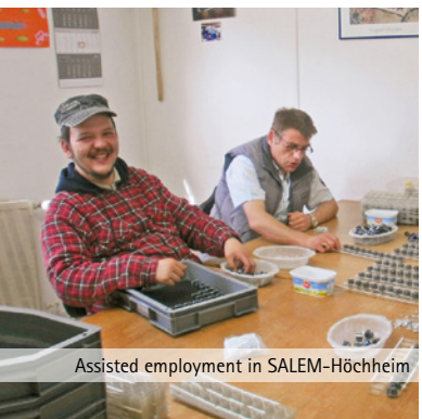
Assisted employment in SALEM-Höchheim

The SALEM-Kovahl children's and youth village takes care of children and young people who have had traumatic experiences. In SALEM-Neestahl adults who need support in their every day lives find their home. Organic farming and gardening enables this SALEM village to be self-sufficient and the farm shop sells their excess produce. FOR MORE INFORMATION: WWW.SALEM-KOVAHL.DE (only available in German).