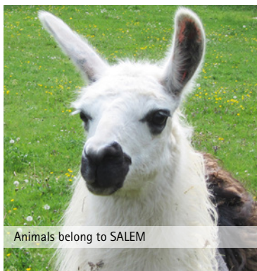
Animals belong to SALEM